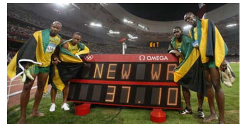
Usain Bolt and rest of Jamaican 4x100m Relay Team

The record breaking perfect performances by Jamaican sprinter Usain Bolt were equally impressive as they were stunning. Setting new world records in the men’s 100 meter and 200 meter sprints is one thing, setting a new world record in the men’s 4 by 100 meter relay as well is truly inspiring, and Bolt’s relay team mates certainly had a role in that. Never have world records been set in these three races by the same athlete in the same Olympic Games—indeed the ultimate triple play.