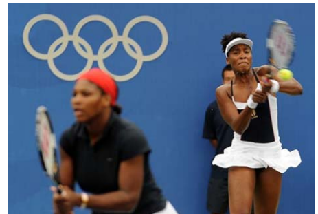
American Williams Sisters (Serena (L), Venus)

American tennis superstars, Venus and Serena Williams, both top ten ranked players, also failed to medal in the women's tennis singles competition. After their surprising losses in the quarter final round, the sisters, much like Federer, also found redemption when they won gold in the women's doubles final over Spain. It was the sisters' second Olympic doubles gold.