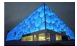
The Bird's Nest (L) and Water Cube Stadium, China