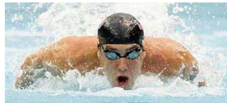
American Michael Phelps

But beneath the big picture lay smaller pictures—lots of them. These smaller, but brighter, pictures capture many stories that inspire and hold tremendous lessons. One of the most inspirational stories of this year's Olympics, without a doubt, was the record breaking performance by American swimmer Michael Phelps. He participated in eight swimming events and won a gold medal in each one, surpassing the prior record of seven gold medals in an Olympic year set by American Mark Spitz. Also inspirational were the performances by American gymnasts Nastia Liukin and Shawn Johnson who won nine medals collectively, including a gold medal each. Under extreme competitive pressures they both put on their best individual performances to fend off fierce competition from their Chinese counterparts and hometown favorites.